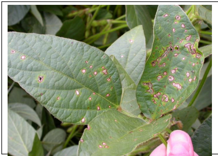
Figure 1. Soybean leaves with symptoms of frogeye leaf spot.

During the summer of 2010, plant pathologists observed an unusually high prevalence of frogeye leaf spot in soybean fields. During August, 2010 symptomatic leaves were sampled from 40 fields in the R5 to R6 stages and taken to the Plant Industry Laboratory for diagnosis. 27 of 40 fields (68%) of samples were confirmed to be infected with frogeye leaf spot. In 2011, 40 of 135 fields (30%) in 19 counties surveyed between July 27th and September 14 th tested positive for frogeye.