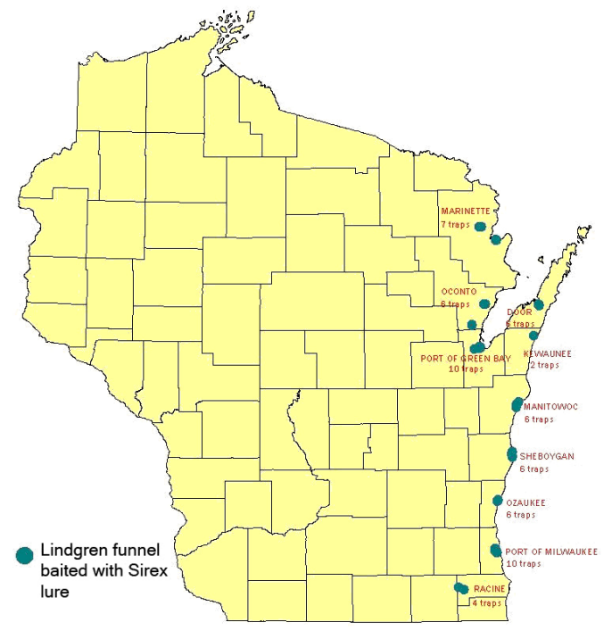
Figure 4. Sirex noctilio survey results.