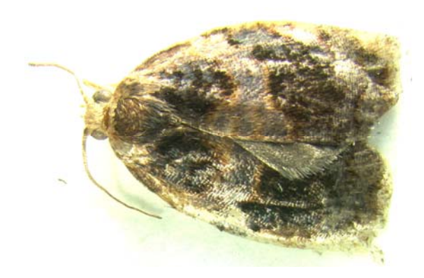
Figure 1. Pyrausta orphisalis Walker