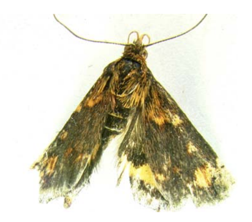
Figure 2. Archips infumatana Zeller