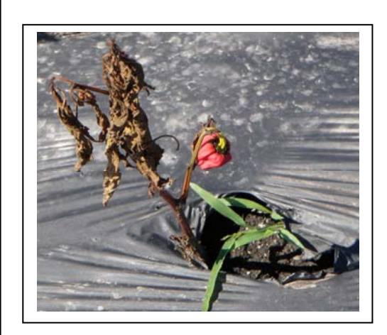
Pepper plant succumbed to Phytophthora crown rot.