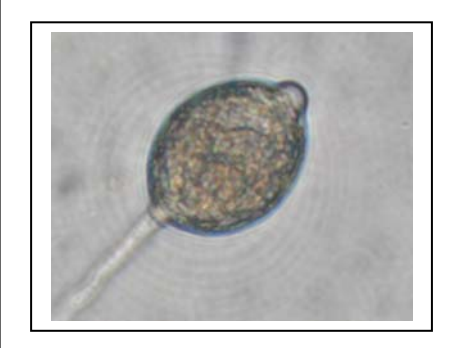
Phytophthora capsici sporangium